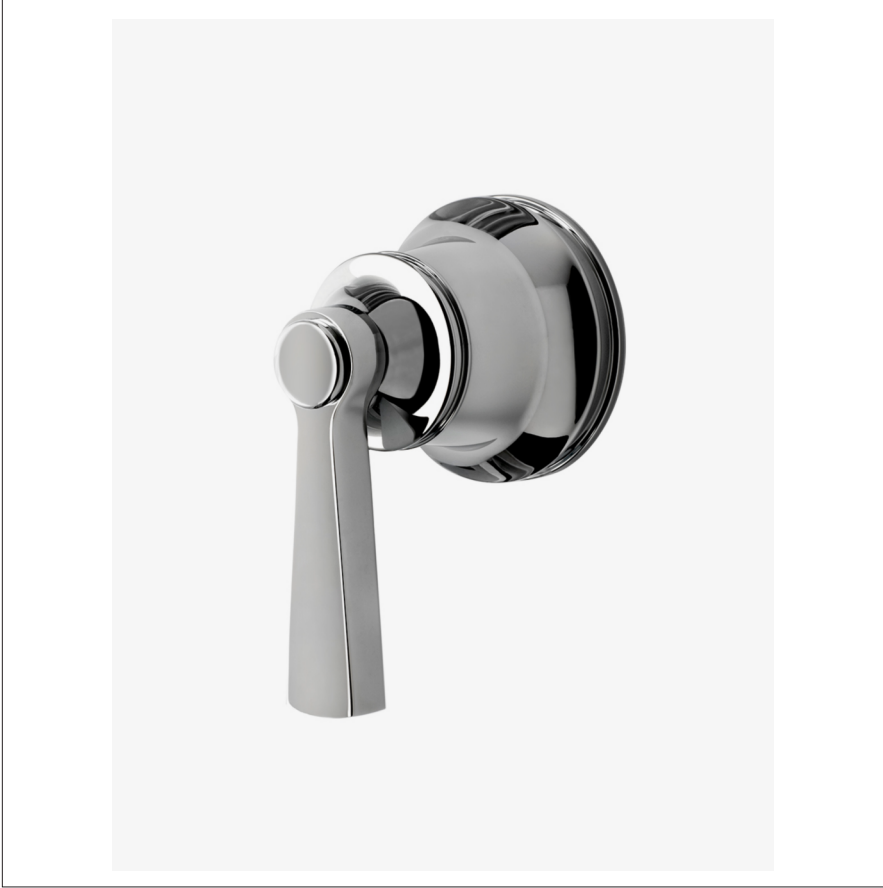
SHOWN IN TRANSIT VOLUME CONTROL VALVE TRIM WITH METAL LEVER HANDLE| TRVC50