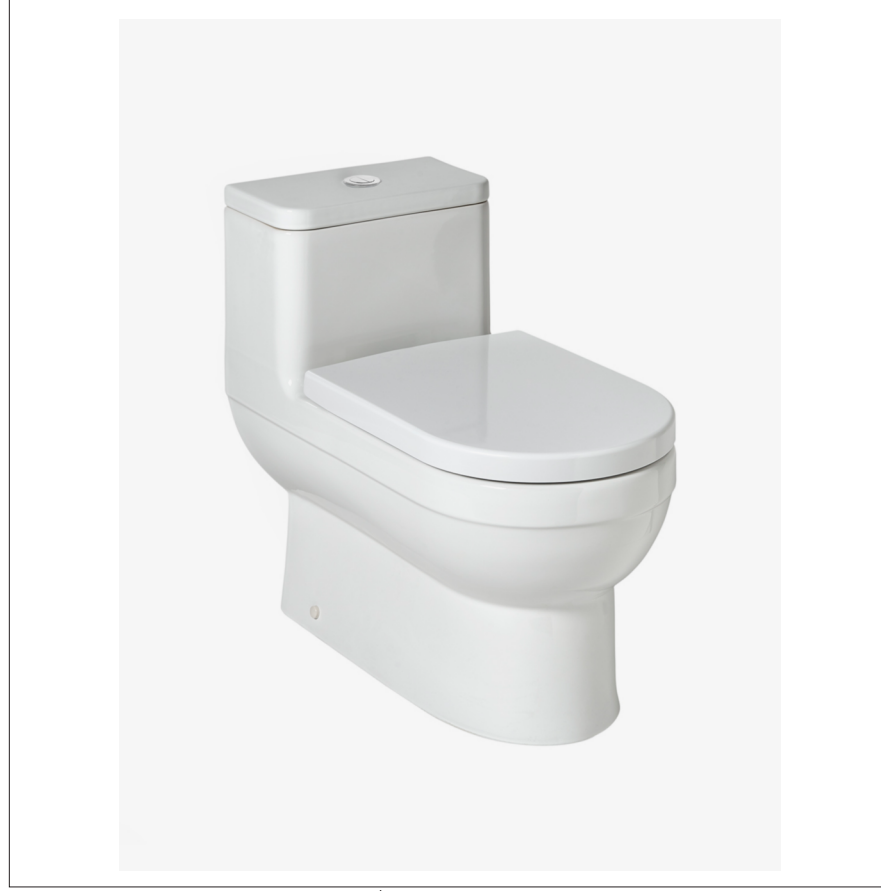
SHOWN IN AXEL ONE PIECE DUAL FLUSH WATERCLOSET | XLWC01