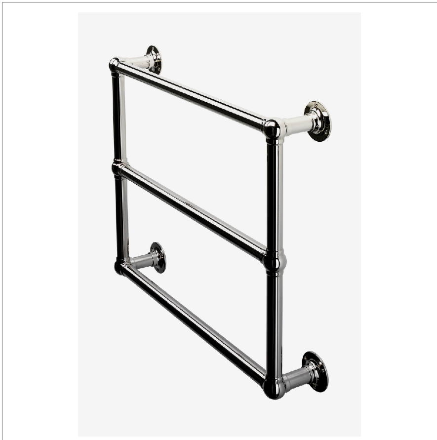
SHOWN IN ESSENTIALS 110V MULTI-RAIL TOWEL WARMER | ETW003