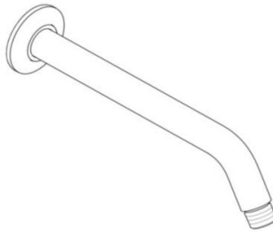
ISO VIEW SCALE: 3"=1'-0"