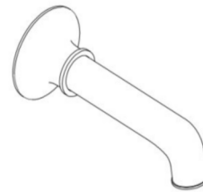
ISO VIEW SCALE: 3"=1'-0"