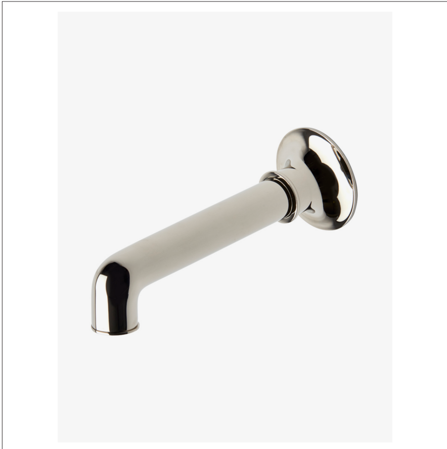
SHOWN IN DASH WALL MOUNTED TUB SPOUT | DSTS80