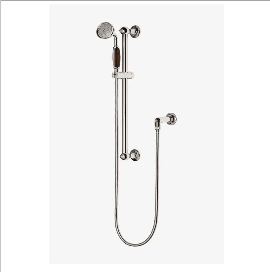
SHOWN IN EASTON CLASSIC HANDSHOWER ON BAR WITH OAK HANDLE| EAHS48

Easton Classic Handshower On Bar with Oak Handle