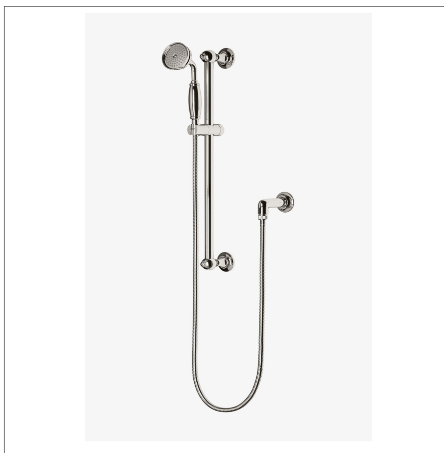
SHOWN IN EASTON CLASSIC HANDSHOWER ON BAR WITH METAL HANDLE EAHS45