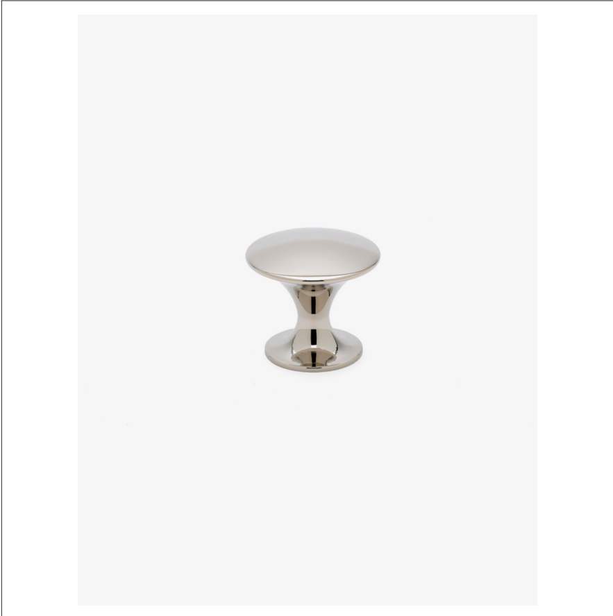
SHOWN IN WATERWORKS 1" MARTINI KNOB| WWHW21