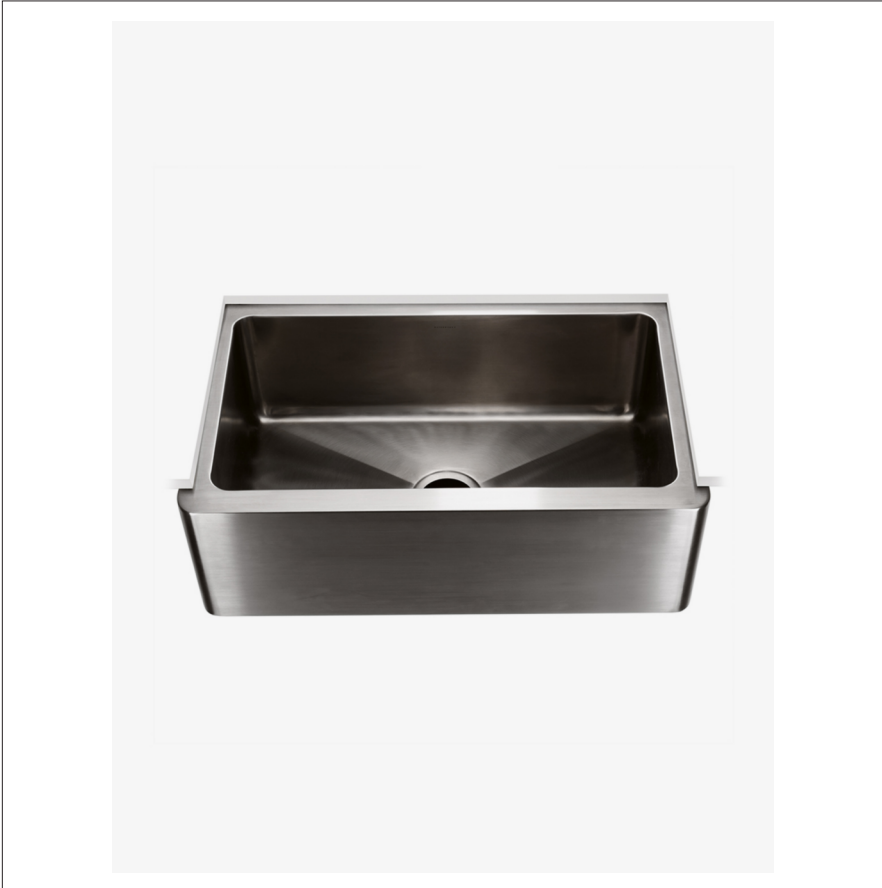
SHOWN IN KERR 30" X 18" X 10 1/8" STAINLESS STEEL FARMHOUSE APRON KITCHEN SINK WITH CENTER DRAIN| KRSK72

Kerr 30" x 18" x 10 1/8" Stainless Steel Farmhouse Apron Kitchen Sink with Center Drain