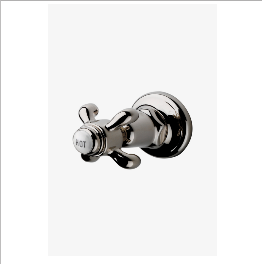
SHOWN IN ETOILE VOLUME CONTROL VALVE TRIM WHITE PORCELAIN HOT INDICE WITH METAL CROSS HANDLE| ETVC71

Etoile Volume Control Valve Trim White Porcelain Hot Indice with Metal Cross Handle