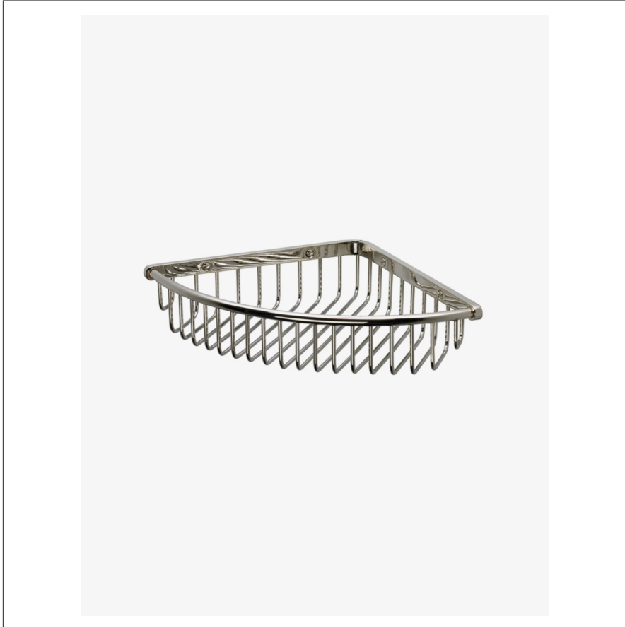
SHOWN IN UNIVERSAL EXTRA LARGE WALL MOUNTED CORNER SOAP BASKET | UNBA75

Universal Extra Large Wall Mounted Corner Soap Basket