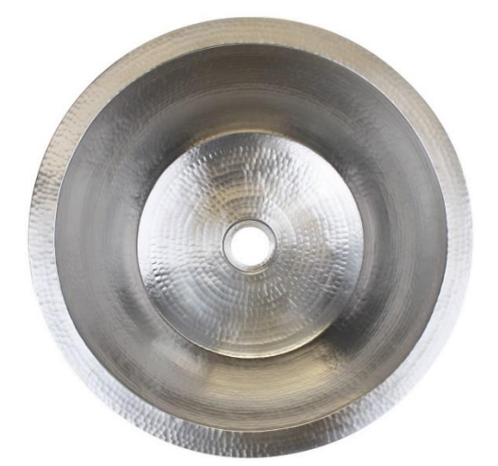
Shown in SN