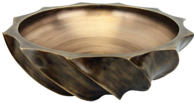
Shown in AB finish