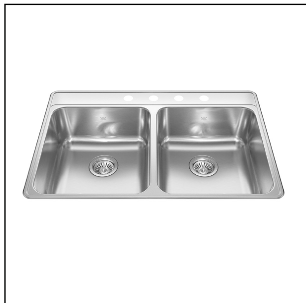
Creemore Topmount/Drop In